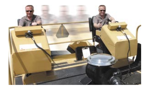
Sliding operator station provides the visibility and control to increase operating efficiency and reduce fatigue. Available with manual or powered control.

Photos and illustrations contain standard and optional equipment.