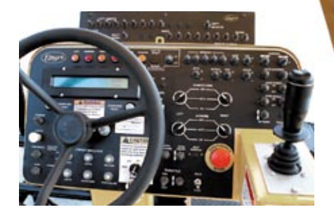
Control Panel provides clear view and easy control. Change from forward to reverse with one hand without clutching.

Front wheel drive ChipSpreader with standard spread hopper