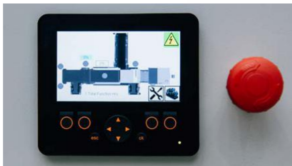
User friendly colour display offering simple operation and diagnostics Customisable settings allow operators to tailor the machine for specific applications