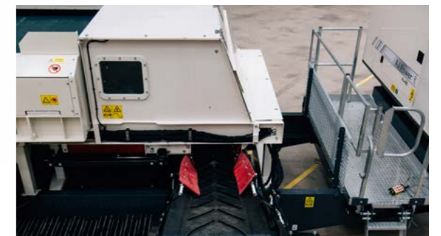
Movable splitter box allowing optimal material flow whilst enabling the machine to fold within 3m wide transport width Unrivalled maintenance access