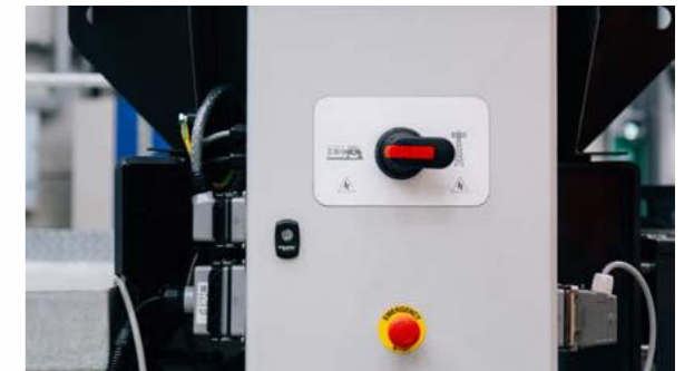
Change over switch as standard to allow the use of onsite mains power