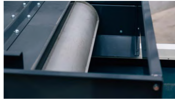
Variable speed 2m (6' 7") wide high strength neodymium radial pole drum for optimal ferrous metal recovery