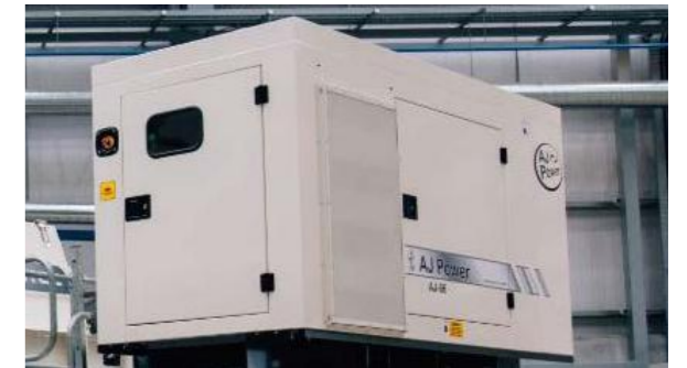
Low noise 60kVa generator offering excellent fuel consumption and serviceability