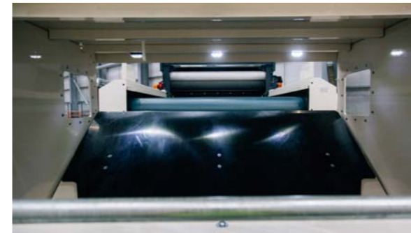
22 pole neodymium eddy current rotor surrounded with an ultra-thin carbon fibre shell to maximise non-ferrous metal recovery